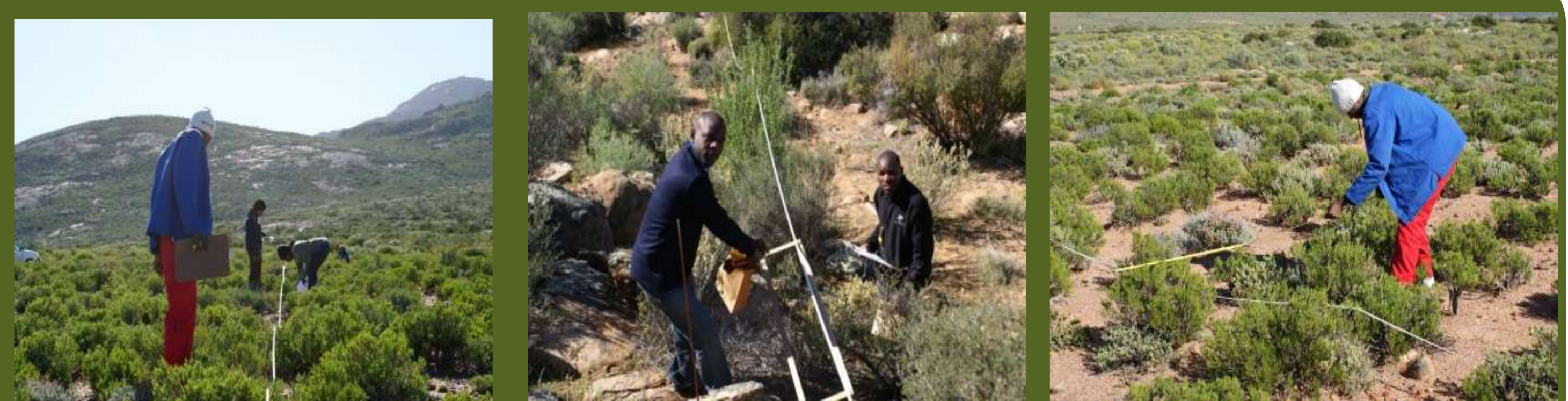
Figure 2: Biomass data collection will be carried out as described in Flombaum and Sala (2007).