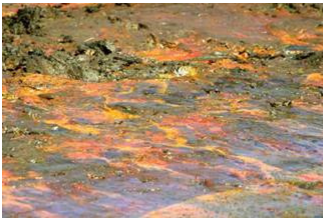
Acid mine drainage caused by inappropriate mining

It must be stated that we are not opposed to responsible mining practices in appropriate parts of the country but it must be made clear that there are “no-go” areas where mining (with its attendant long term impacts) would be an entirely inappropriate land-use activity.