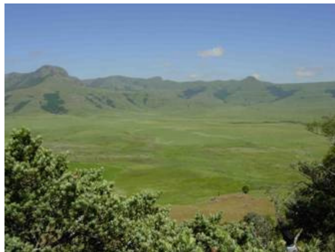
Would you want this to be turned into a coal mine?