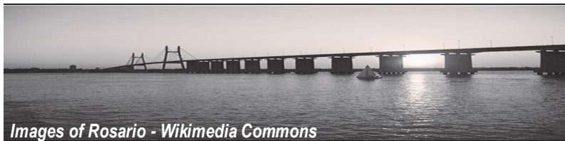
Images of Rosario