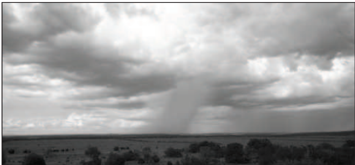
Rain in Africa