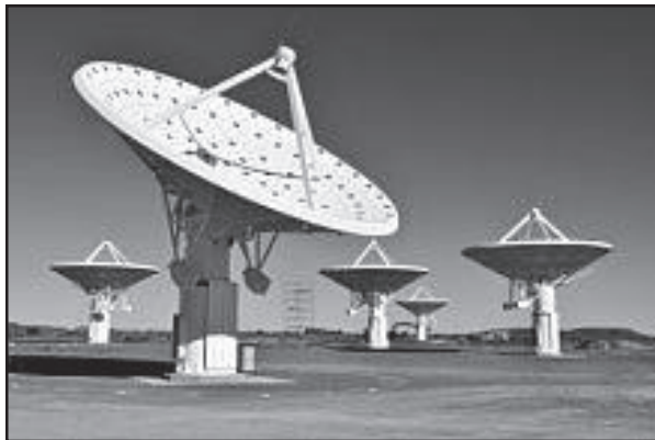
SAEON scientists anticipate that they will use conservation areas and protected environments such as the SKA to develop control and benchmarks sites.