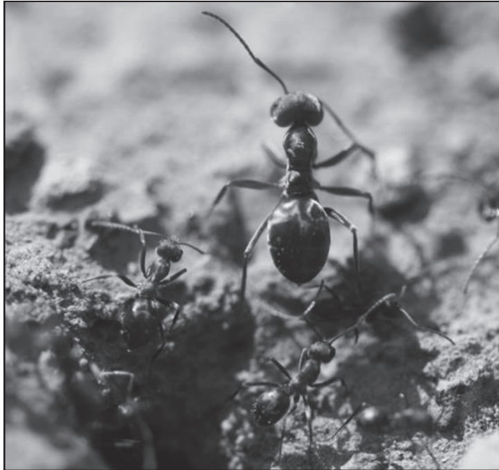
Ants and termites play a key role in the world we live in.