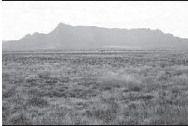
The project will develop a baseline of the Karoo environment, ecosystem structure and function with an eye to predicting sensitive species and habitats likely to be most vulnerable to shale gas development impacts.

the paucity of biological data collection prevalent across most of the Karoo, as well as address many other potential questions.