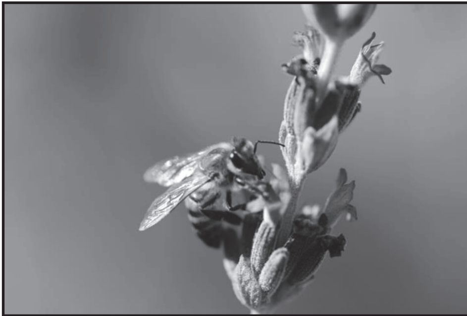
A honey bee on a flower