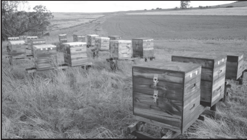
Bees used in the pollination of canola