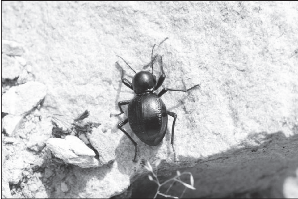
Insects are key to holding the food chain together. Without them, much of what we eat today would not exist.