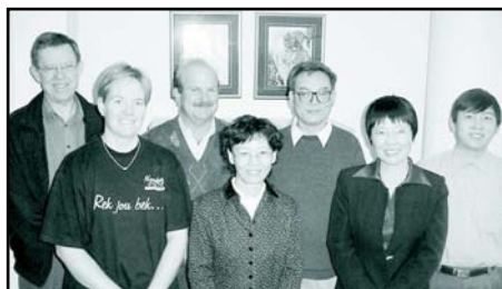
The South Africa-China research group

In 2003 South Africa and China reached an agreement for a joint research programme with regard to the selection and evaluation of drought-tolerant species mainly for the restoration of degraded and desertified arid areas in both countries. After some in-depth discussions and exchange of ideas it became evident that South Africa and China face similar problems regarding