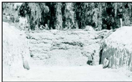
Above: - Silage: discussing high quality silage at the pit face.