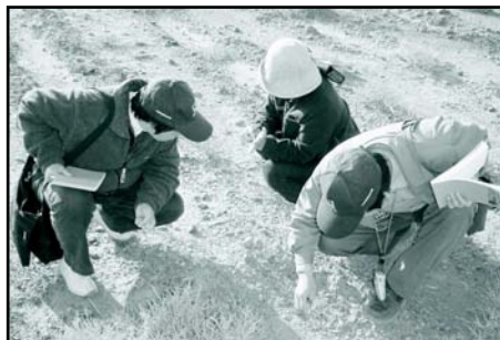
The Chinese visitors taking a better look at South African vegetation

enthusiastic team finalized the details of the research programme. In the future a team from South Africa will undertake a similar visit to China and hopefully come back with a bag full of ideas.